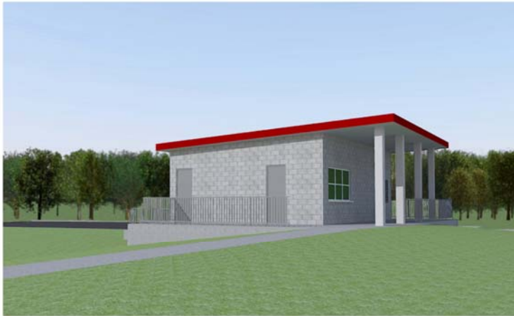
CONCESSION & RESTROOM SOUTHWEST VIEW