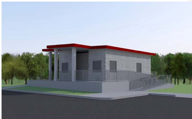
CONCESSION & RESTROOM NORTHEAST VIEW